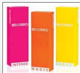
Belotero Soft, Basic and Intense by Merz GmbH and Co., KGaA