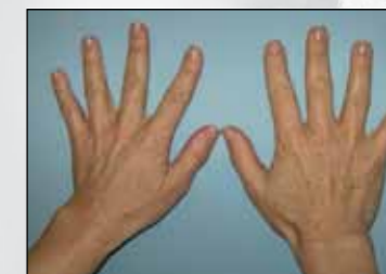
Hands before Tx

"By injecting minimal amounts of this product all over the face, we can achieve much better hydration of the skin compared to any other treatment."