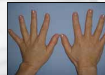
Hands after Macrolane Tx