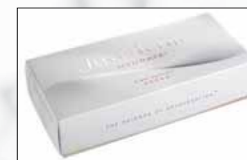
Juvéderm HYDRATE by Allergan

Choosing the appropriate dermal filler product, based on the needs of the patient, is of the utmost importance; however, the practitioner's injection technique is also significant. While many physicians continue to use more established injection methods, new systems are offering the potential for improved results.