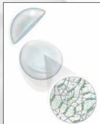
Inside a Geleon: illustration of a 3D polysaccharide structure saturated with ringer solution