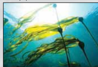
Natural marine algae